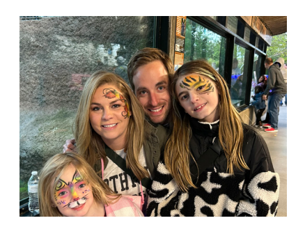
Members enjoyed a complimentary evening at the Topeka Zoo with our October "Wild About You" member appreciation event.