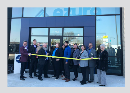
Mission's ribbon-cutting ceremony was held in March 2024.