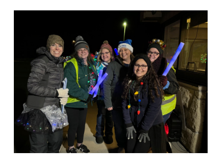
Staff volunteered at TARC's Winter Wonderland this past holiday season offering free entry to the first 50 vehicles that evening.